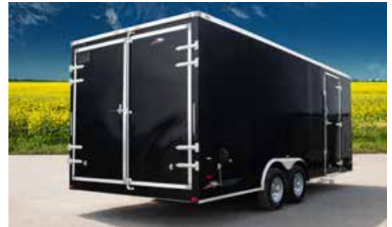
8.5' x 20' Night Hawk Auto with Double Rear Doors and additional Hinges