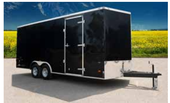
8.5' x 20' Night Hawk Auto shown with optional Bar Lock Side Door